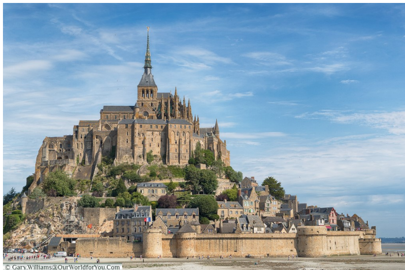
- Mont-Saint-Michel—From our Normandy Campaign.

We are heading off for a road trip through Croatia. We depart the UK, and drive through France, Germany, Austria, Solvenia before slowing down to explore Croatia