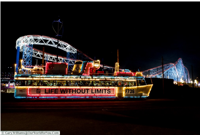
- An illuminated tram with the Pleasure Beach as a backdrop